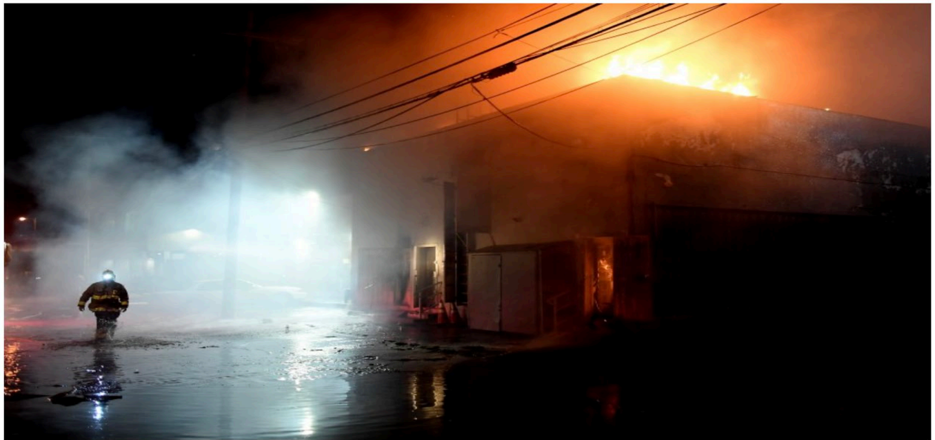
A firefighter walks behind a burning building on Melrose Avenue during civil unrest in Los Angeles on Saturday.

The FIRESCOPE Board of Directors/OES Fire and Rescue Services Advisory Committee vision is to continue national leadership in the development of all-hazard management and multi-agency coordination systems, to enhance and encourage full participation by the California fire service in the statewide Fire and Rescue Mutual Aid System, and to provide a common voice for the California fire service relating to these issues.